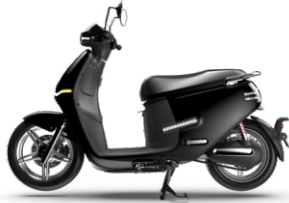
BLACK MAT FINISH