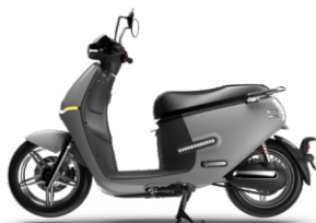
GREY MAT FINISH